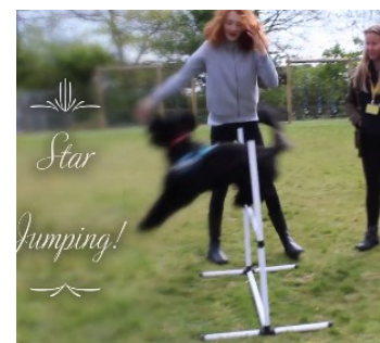
Training Star our Therapy Dog