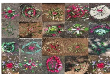
Making Mandalas in Forest School