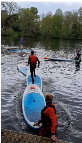
Paddle Board Diving at Bicton College

Here are some of the things we have been doing this half term—there is lots more on line!