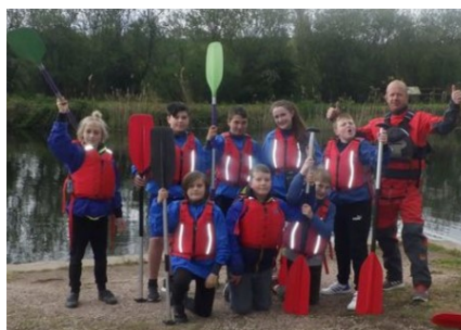
Year 7 Canoeing