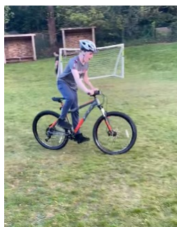
Cycling on the lawn