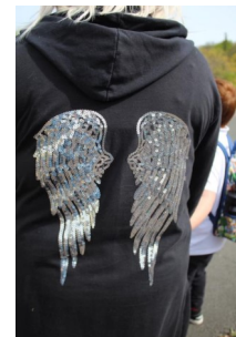
Our Angel TAs