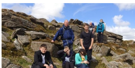
Walking on the Moors